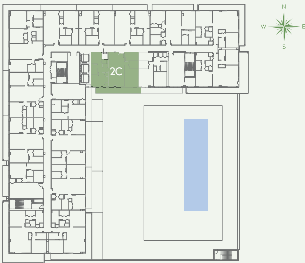
Key Plan of floors 6 & 7.