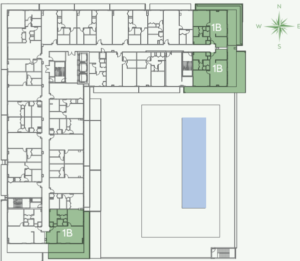
Key Plan of floors 9 & 10.