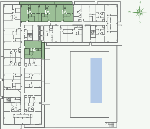
Key Plan of floors 9 & 10.